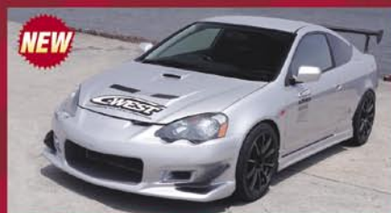
C-West INTEGRA DC5 (Zenki)