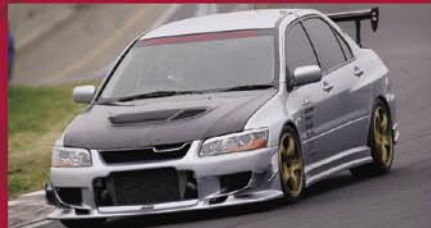
TSUKUBA CIRCUIT TIME ATTACK RECORD BREAKING AERO-PARTS C-West LANCER EVOLUTION CT9A