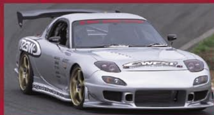
THE SUPER TAIKYU 2002 CLASS 3 CHAMPION C-West RX-7