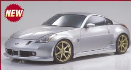
ZEROSUN FAIRLADY Z Z33