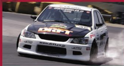
DRFT ALTEZZA SXE10