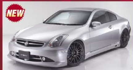
ZEROSUN SKYLINE V35