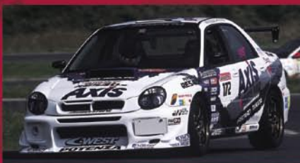
2002 ALL JAPAN GYMKHANA CHAMPIONSHIP A-4 CLASS AXIS BS IMPREZA WRX