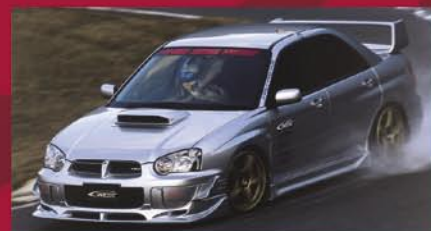
C-West IMPREZA WRX STI