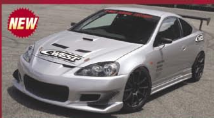
C-West INTEGRA DC5 (Kouki)